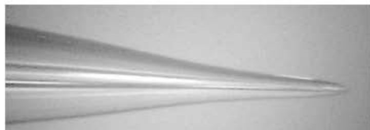
Electrospray Tip at 400x

The complete system (part # 44301) includes the hand held digital microscope with USB cable to connect to your PC, adjustable microscope stand, PC