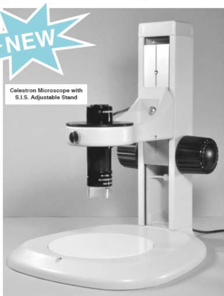
Celestron Microscope with S.I.S. Adjustable Stand

Apple Macintosh OS X 10.3 or later New driver can be downloaded also