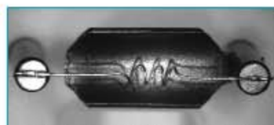
Rhenium Alloy Filament At Failure - 20x