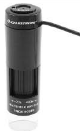
Digital Microscope for Hand Operation